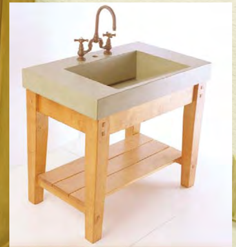
The Commercial RampSink P-Series